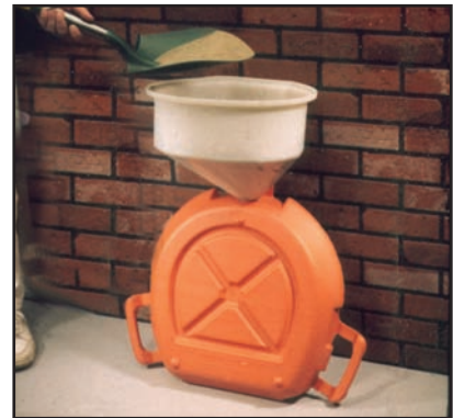
Base can be filled using 50 lb. capacity funnel. The sand is permanently sealed in with a positive lock plug.