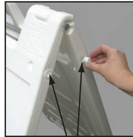
Sand Fill Holes

Each sign frame has four fill holes, two on each side of the frame.