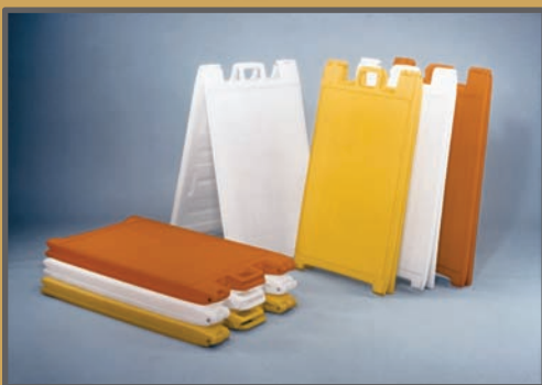
Signicade comes standard in White, Orange, and Yellow