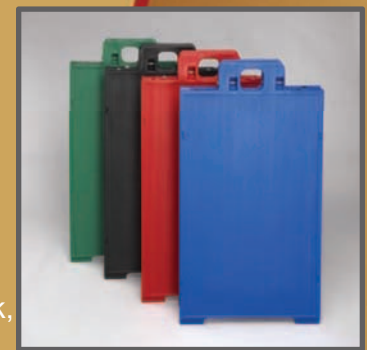
Marquee comes standard in White, Blue, Red, Black, and Green